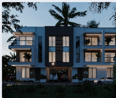
BLISSVILLE TERRACES CARIBBEAN LAKE CITY ESTATE